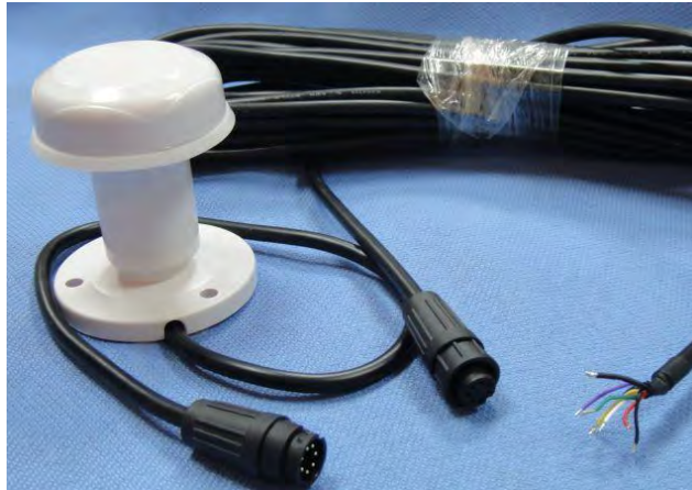
Garmin compatible Marine GPS Receiver

MTK MT3339 Chip GPS Marine Receiver with Full Waterproof