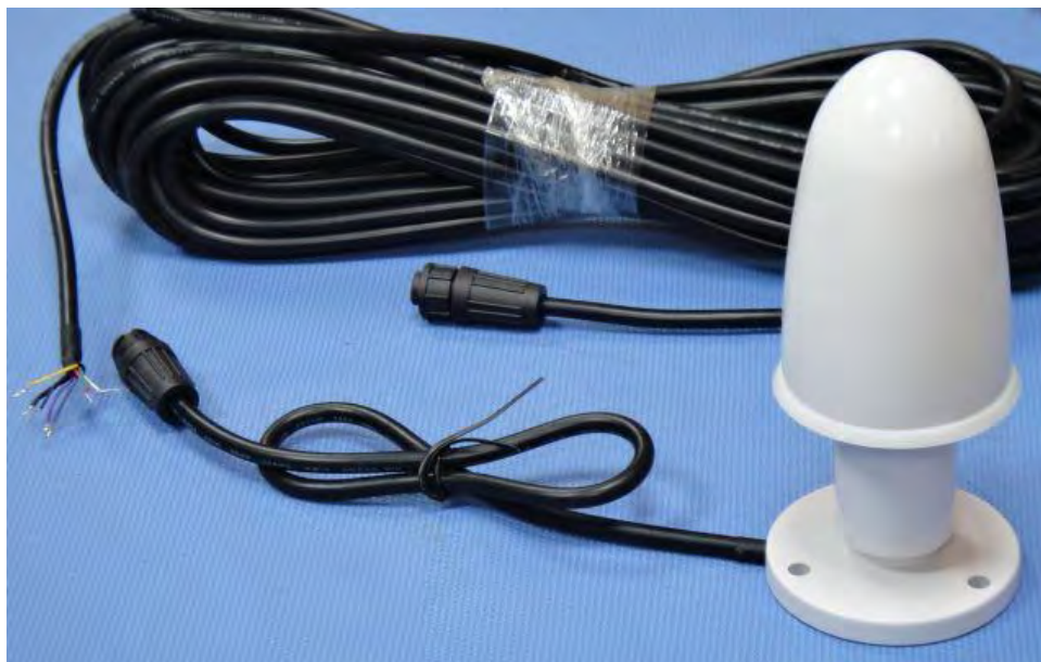
Garmin compatible Marine GPS Receiver

MTK MT3339 Chip GPS Marine Receiver with Full Waterproof